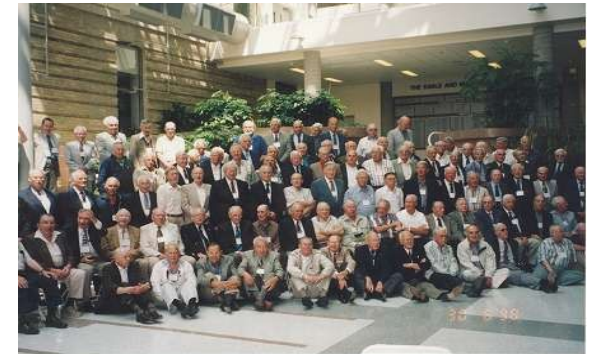
Study members attending the Fifty Year Anniversary of the Manitoba Follow-up Study. University of Manitoba, June 30, 1998.

The Manitoba Follow-up Study is certainly unique in the world due to its scope, duration and completeness of data. This attests to the remarkable interest and dedication of the members. From 1983 to 2000 the majority of the funds for the operation of the Study have come from the generous donations of the members. It is believed that this is the only Study in the world financed by the members who are being studied!